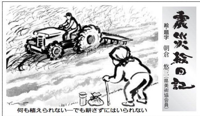
Figure 3. Asakura Yūzō's Disaster Picture-Diary , "He can't plant anything... but he can't relax unless plows his field". Fukushima Minpō , 29 April 2012, p. 19.