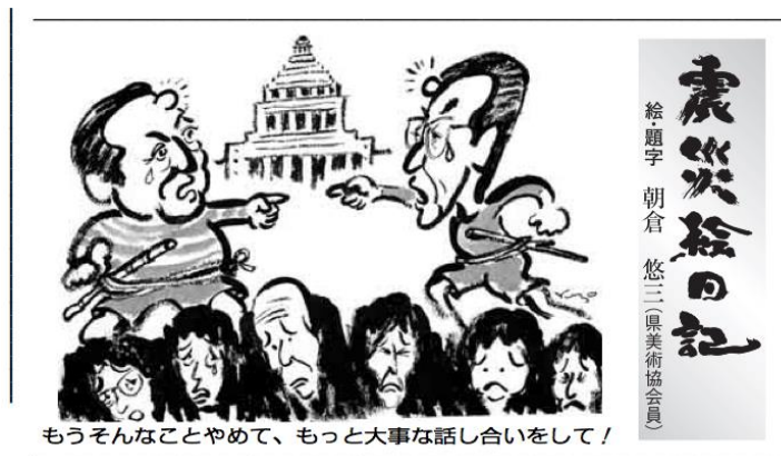
Figure 7. Asakura Yūzō's Disaster Picture-Diary , "Enough of this sort of thing. Talk about something more important". Fukushima Minpō , 20 May 2012, p. 19.