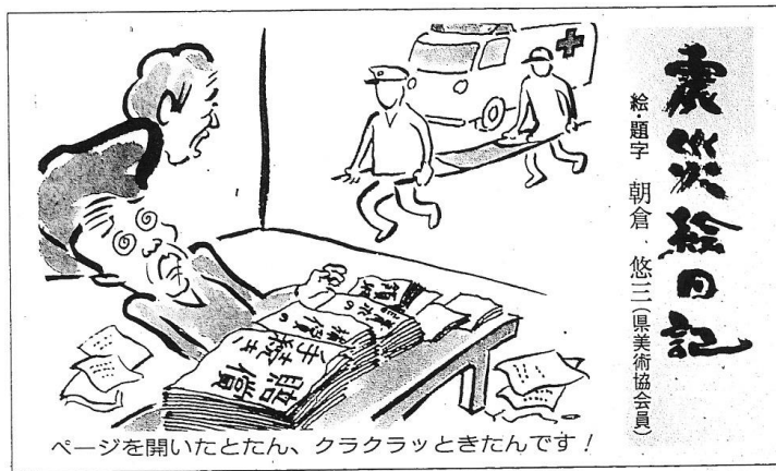
Figure 6. Asakura Yūzō's Disaster Picture-Diary , "As soon as he opened the pages he came over all woozy" (Paper pile = 'compensation application procedures'). Fukushima Minpō , 2 October 2011, p. 19.