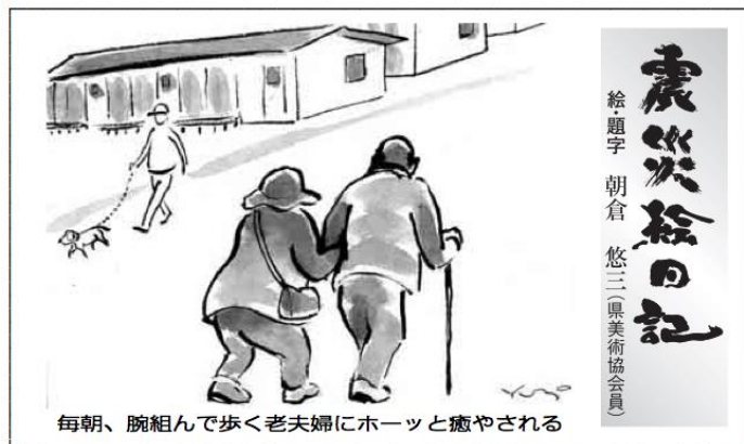
Figure 2. Asakura Yūzō's Disaster Picture-Diary , "Every morning, my heart is warmed by the sight of an elderly couple walking arm in arm". Fukushima Minpō , 28 October 2012.