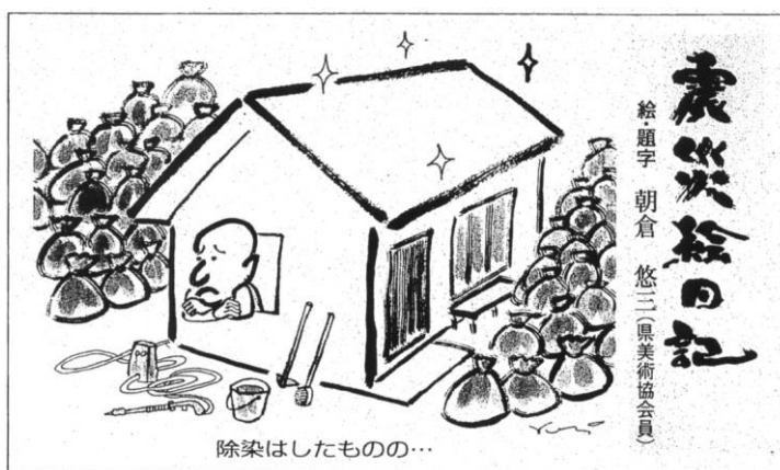
Figure 4. Asakura Yūzō's Disaster Picture-Diary , “I’ve decontaminated my home, but...”. Fukushima Minpō , 3 September 2014, p. 10.

The ministry issued guidelines on how people in the affected areas should decontaminate their own properties to reduce caesium levels: people were advised to wear protective clothing and masks, remove leaves from rooftops, hose down homes and remove the top layer of soil from around their homes (Aoki 2012). However, the ministry gave little indication about what to do with the bags of contaminated refuse resulting from this. Much was left to individuals and regional governments to deal with. Asakura satirises this half-measure by central bureaucrats. He depicts a glum faced man leaning out of his sparkingly clean decontaminated home, his decontamination tools in front of him, but his home is surrounded by mountains of bagged contaminated soil and leaves resulting from the cleanup. The caption reads, “I’ve decontaminated my home, but...”.