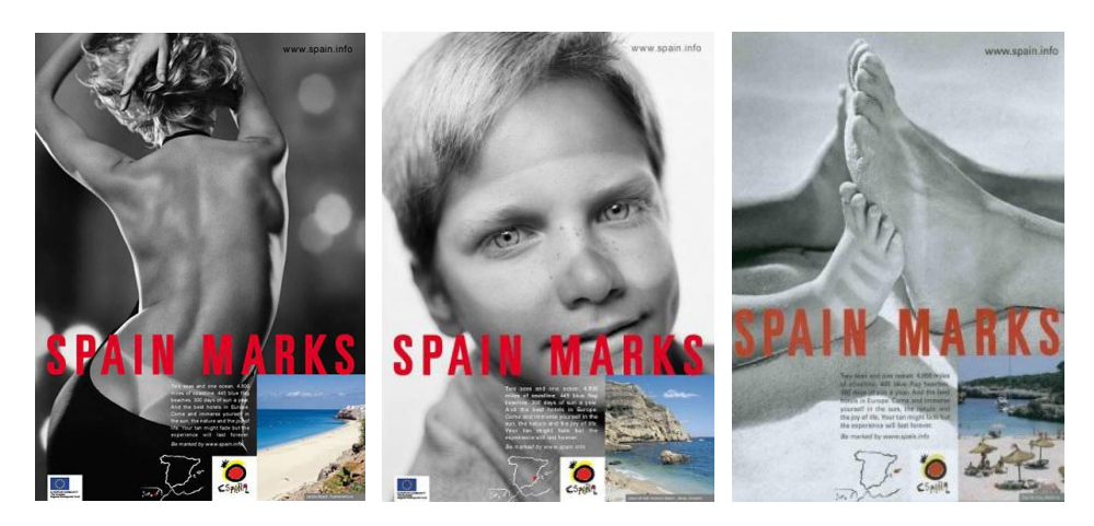
Figures 4, 5 and 6. Seaside tourism.