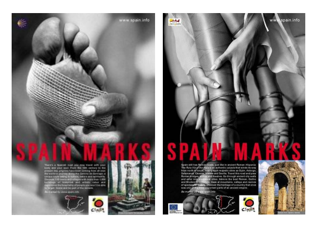
Figures 8 and 9. Cultural tourism.

Irony is included in the campaign as an example of overcoming pain. The advert in Figure 8 invites tourists to be part of the miracle of the Camino de Santiago, to acquaint themselves with the nature, spirituality and hospitality of this walk. Pilgrims come from all over the world and subject their bodies to physical hardship by enduring this path of kindness and humility. The physical hardship is showcased in Figure 8 through bandaged and bruised feet. Another form of pain is portrayed in Figure 9, which shows the marks on a woman's legs after wearing the Roman caligae sandals, which were used by legionaries, and are known for leaving marks.