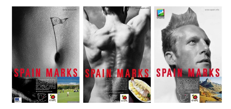
Figures 12, 13 and 14. Images with double meanings.

The polysemic meaning of Figure 12 resides in that the belly button simulates a golf hole; Figure 13 makes a comparison between the man's backbone and a fishbone; and Figure 14 indicates the similarity between the man's hairstyle and the peaks of a mountain. Although most of the participants have provided the correct answers, 40 percent of them did not understand the polysemic relationships portrayed in the images. This reinforces the premise that some of the messages in the campaign were not understood by its target audience. In this case, misunderstandings were not only caused by the text and its translation but also by the images themselves.