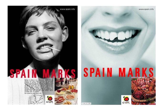
Figures 2 and 3. Gastronomic tourism.

Figures 2 and 3 represent examples of gastronomic tourism. The face is a reflection of the soul, and these two advertisements are clear examples of this. Facial expressions and gestures are very powerful ways of transmitting meaning and emotions, such as joy. Figure 2 portrays a woman with a toothpick in her mouth, symbol of the tapa , and in her eyes, one can see the amusing drunkenness of Spanish wine. The face has the ability to capture that moment which invites us to share and to enjoy new flavours. On the other hand, an unfortunate bite may become a memory of the good times (Figure 3). The image also implies the important virtue of being able to laugh at oneself irrespective of the inconveniences of a particular situation. Everything is worthwhile if the experience was enjoyed through the five senses (Figure 3).