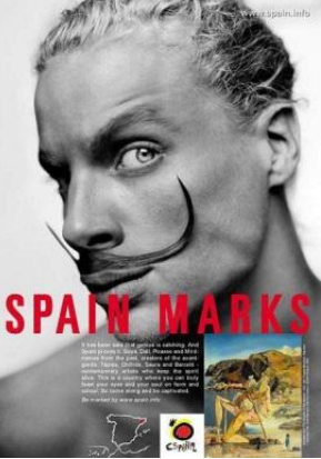
Figures 10 and 11. Artistic tourism.

Irony was created in the adverts through the use of double meanings. The images of the campaign are diverse to generate curiosity by reflecting on interesting contrasts, for example the popular and the cultured, the folkloric and the academic, the beach and the heritage. To make this type of humour work, language elements are used to create new meanings that are interpreted as comical by the consumer.